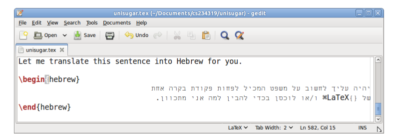
Figure 4: A Hebrew sentence containing a control sequence (with unisugar).

Figure 3 shows this sugared input as it appears in the gedit editor. We can see that the entire control sequence phrase is written left-to-right, with the escape character first, and the pair of curly brackets last.