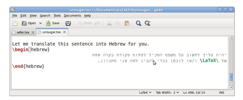
Figure 3: A Hebrew sentence containing a control sequence (without unisugar).

Figure 3 shows what this might look on an actual text editor. This may not seem too complicated, but a closer look would reveal that the production and inspection of this LATEX is hindered by two or three annoying hidden issues.